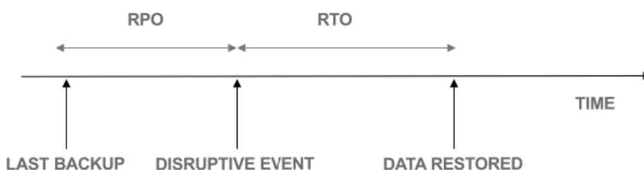
Figure 3 - Visual representation of RPO and RTO

RTO is the maximum loss of availability following a disruptive event measured by the maximum amount of time before the application fully recovers.